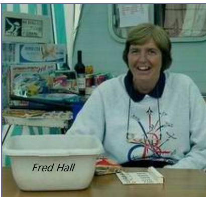
...while Trish looks after the raffle tickets