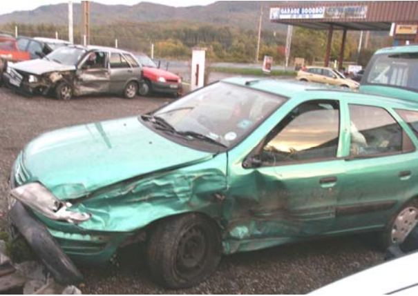
Dave's Citroën amid other French dodgems. Perhaps he will take a Humvee next time?

A few days later we said goodbye to the Aude and set off back to Provence where on the 23rd we were due to fly the next competition at the permanent site near Aix-en-Provence. We found our rooms at the Campanile in Aix and then went into the town centre to visit some bars (as you do!). We discovered that Saturday was market day in Aix and spent a couple of hours on Saturday morning around the market buying a few holiday presents.