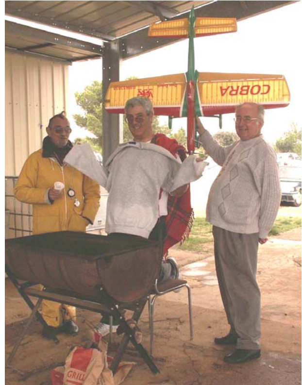
Who's first for freshly barbecued Cobra?