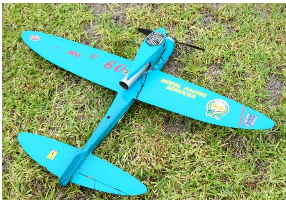
Class 4 winning model.