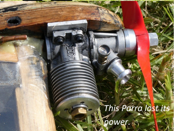
This Parra lost its power.