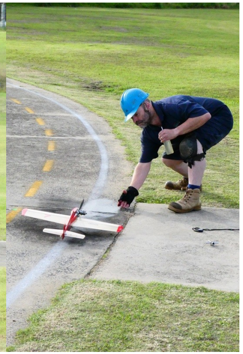
Some 27 Goodyear pictures.

Saturday at CLAMF had three racing events planned.