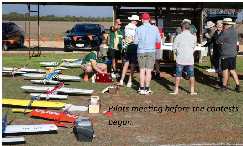
Pilots meeting before the contests began.