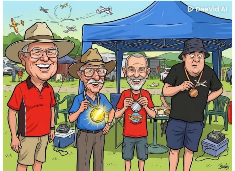
The Taster Stunt podium at The Hunter Valley Championships 2026

Please note: the CLAS State Combat events for 2026 will be held at the Muswellbrook Field on the NSW June long weekend being 6 th 7 th and 8 th June 2026. It is expected that the events will be completed on the 6 th and 7 th unless we have an unusually high number of entries or events are weather delayed.