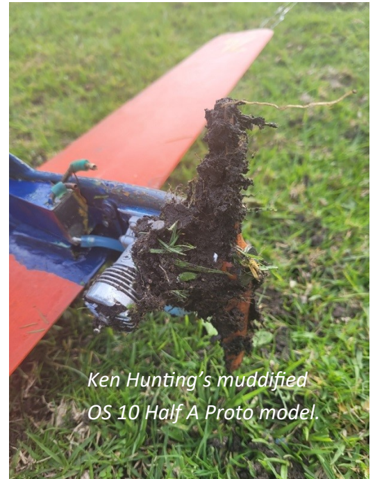
Ken Hunting's muddified OS 10 Half A Proto model.