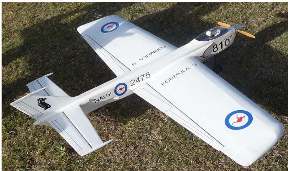
Jeff Prosser's Formula S / OS LA46