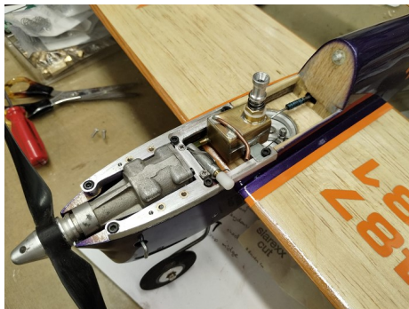
Adrian Hamilton's finished model here.

It's only had three or four races so far, but one at 5:14 is starting to look good for NZ Classic A where the target is 5:00 flying over grass. It's legal for Classic FAI too, so I might make a tarmac wheel for it.