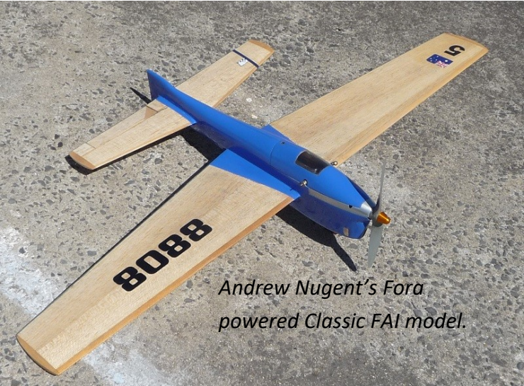
Andrew Nugent's Fora powered Classic FAI model.