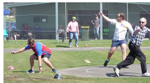
Off and running in the Vintage A final.

It's been probably two years since Classic B has been flown at Frankston so it was good to see five teams with models ready to race on the big grass circle. The teams that made the final were happy to sit on their first heat times. Bailey/Hunting and Ray/Laing flew a second heat but Ray/Laing broke a propeller at the pit stop and Bailey/Hunting blew a plug.