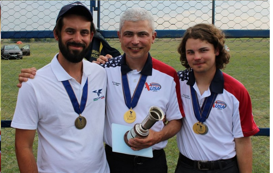
Top three placings in F2A.