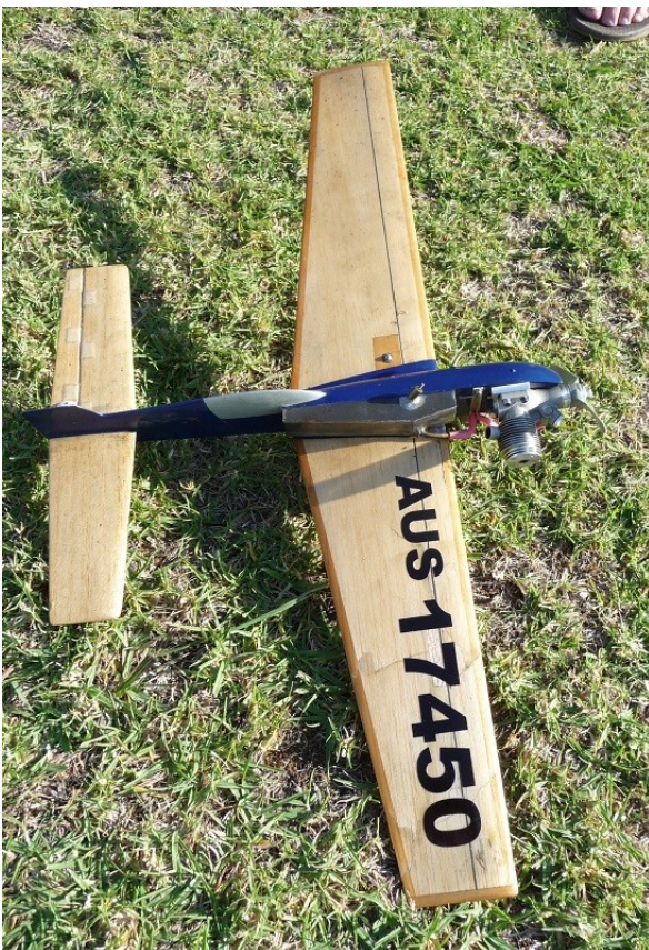
Here are a couple of model examples.

Timing begins from ROG take off and handle must engage the pylon within two laps from take off. Max. flying height 4.5 metres.