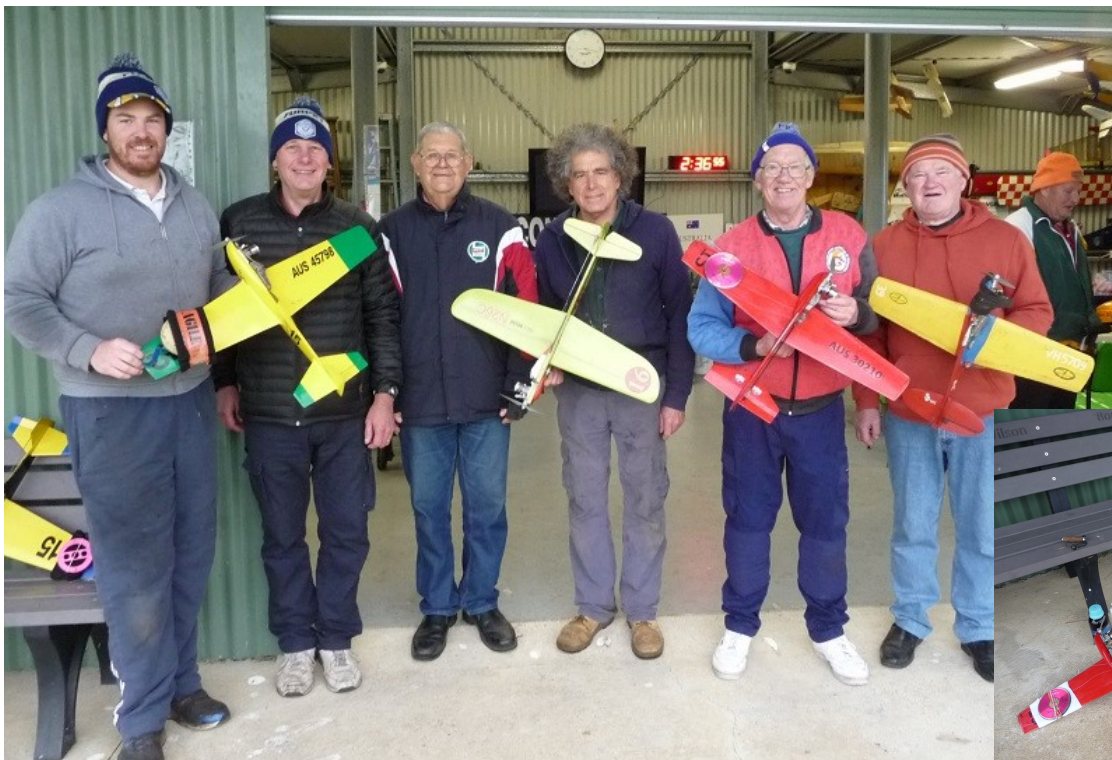
The teams that took part in 27 Goodyear at the CLAMF competition day.