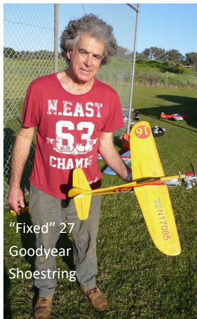
“Fixed” 27 Good-year Shoestring