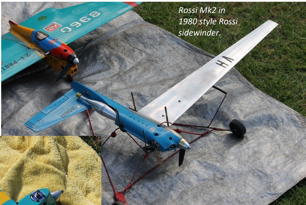
Rossi Mk2 in 1980 style Rossi sidewinder.