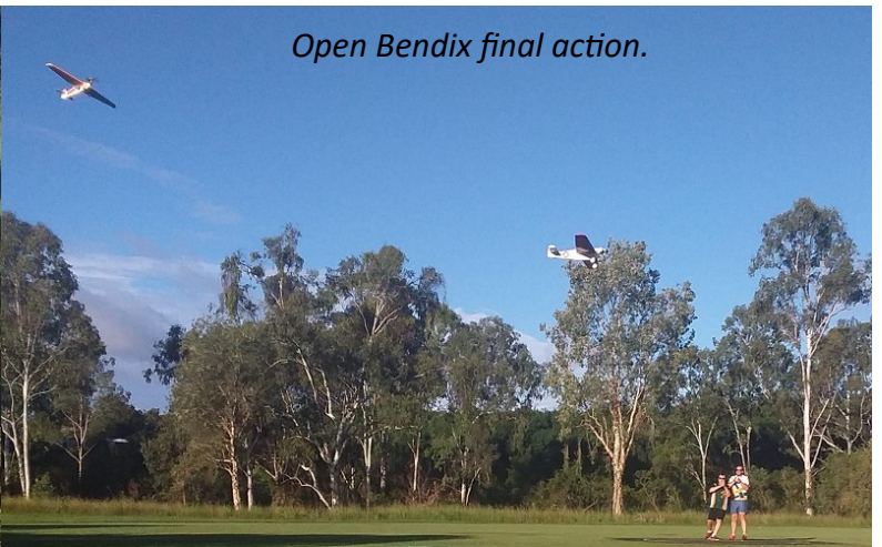
Open Bendix final action.