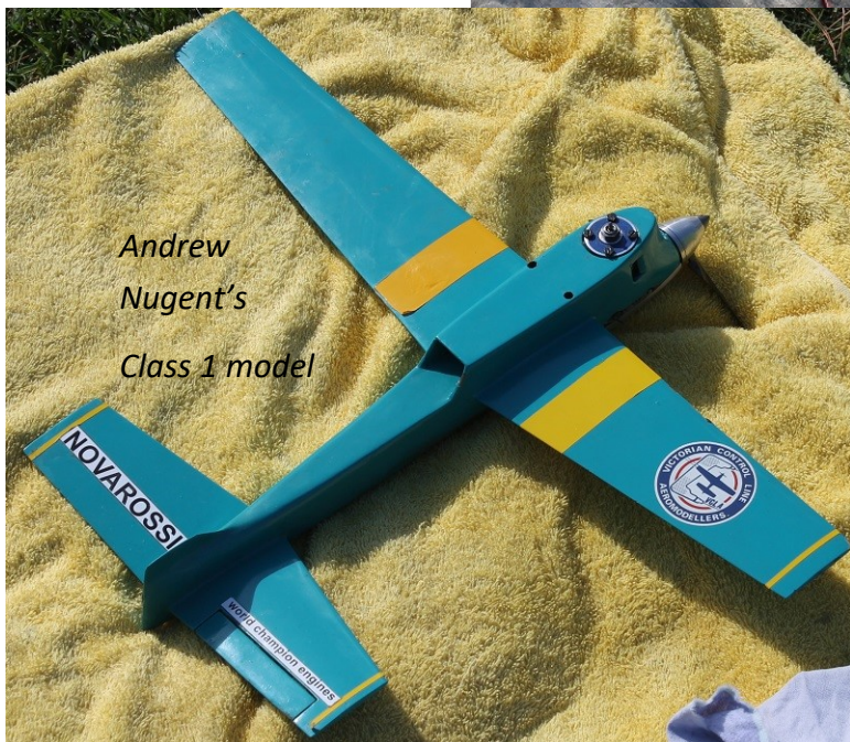
Andrew Nugent's Class 1 model

For local comps we are thinking of having a Class 1 sub class to try and get the models that are powered by OS PS11, Enya CX11, Asp 11, Webra speedy 10, etc. and any other non Novarossi, or OS, etc. car motors. There are a few good OS PS 11 engines that are around but are not competitive with Nova Rossi.