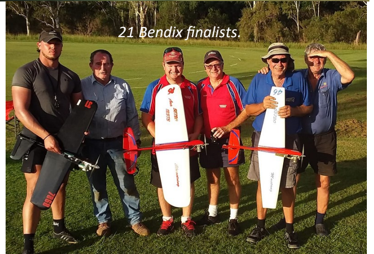
21 Bendix finalists.