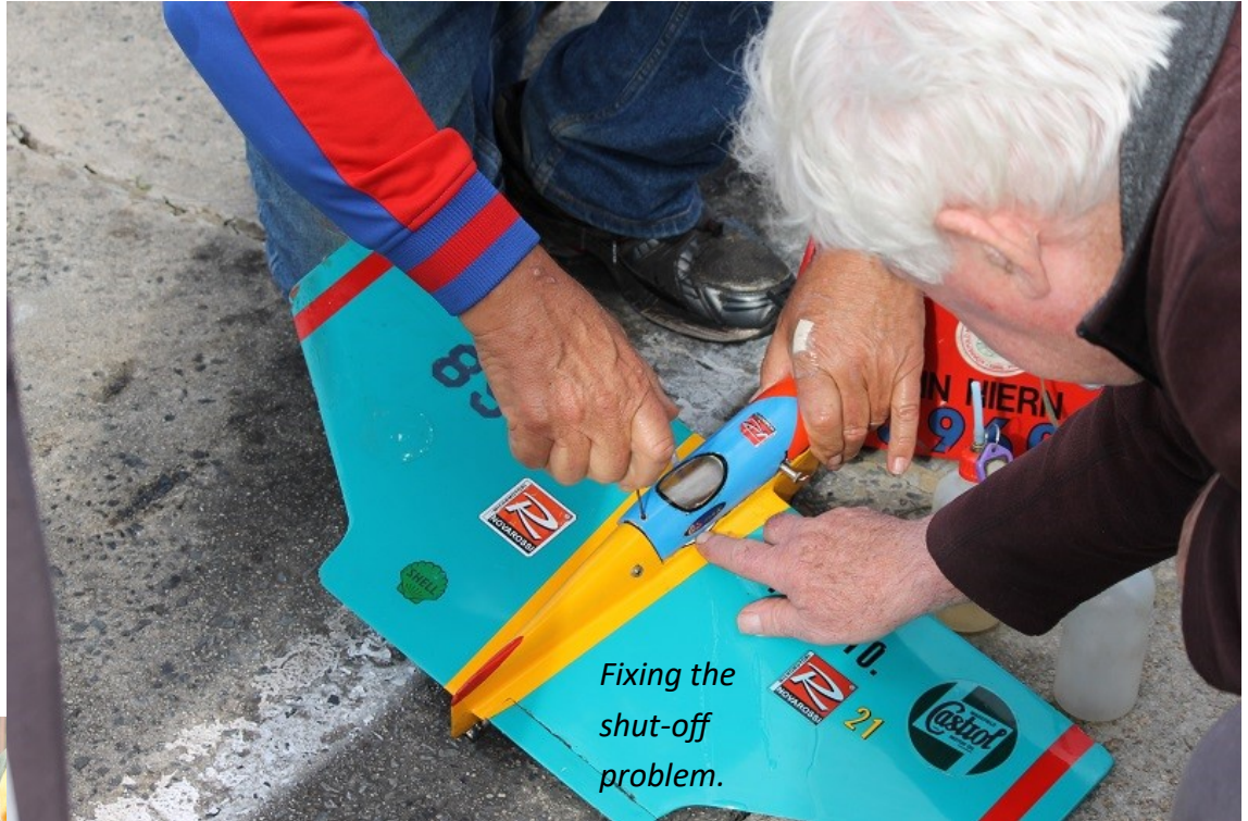
Fixing the shut-off problem.

I flew first up to fly my troublesome B Proto model after yet another rebuild, first 2 flights the cut-out keep going off, it's never done that before, so I took it off and finally broke the Proto record. The model is now due to be checked by an FAI observer. The model is powered by an OS 30 truck engine on an old style pipe.