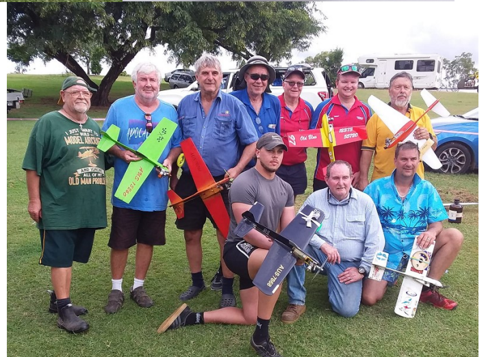
27 Goodyear teams.