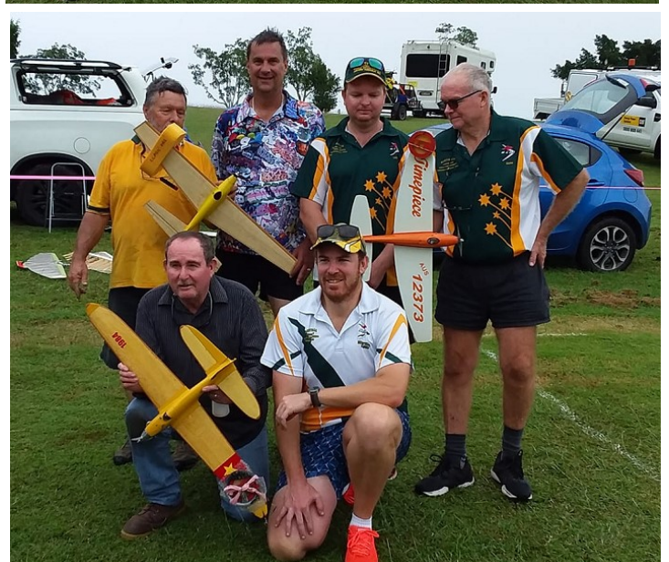
Top three teams in Classic FAI T/R.