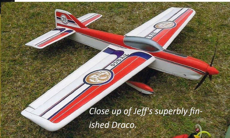
Close up of Jeff's superbly finished Draco.