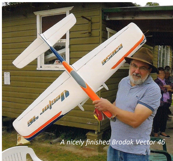
A nicely finished Brodak Vector 46