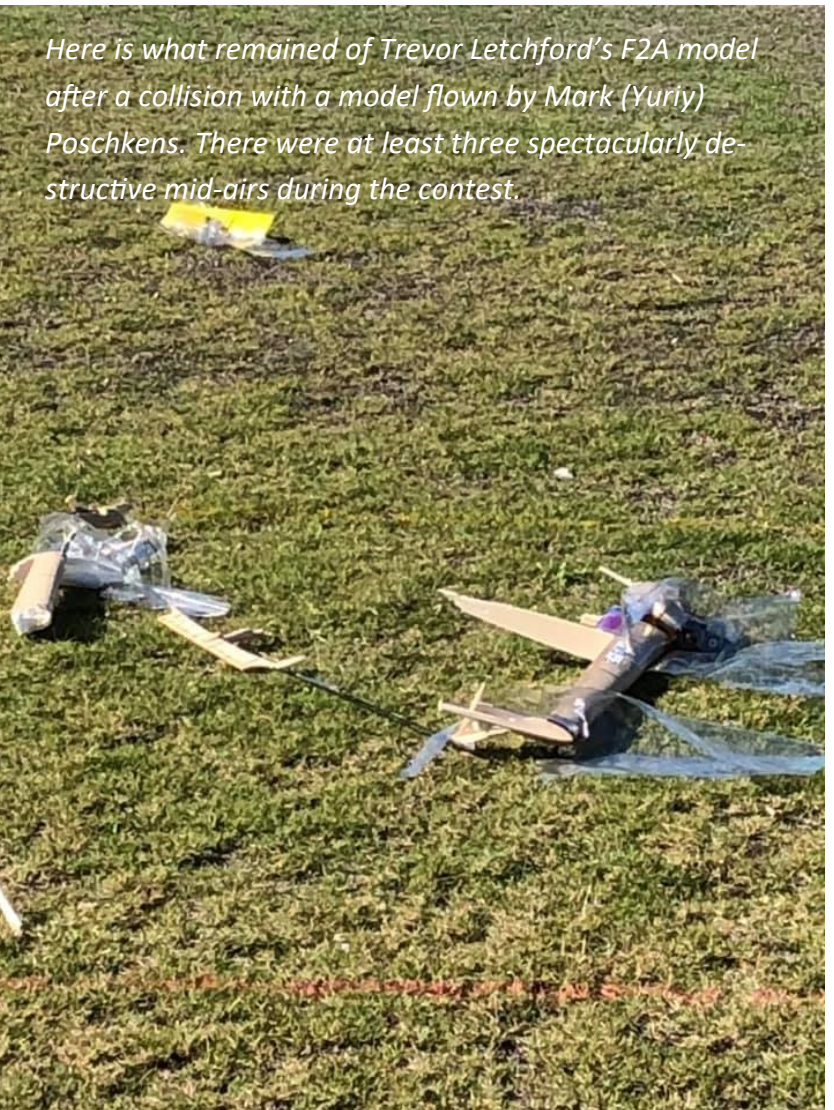
Here is what remained of Trevor Letchford's F2A model after a collision with a model flown by Mark (Yuriy) Poschkens. There were at least three spectacularly de- structive mid-air during the contest.