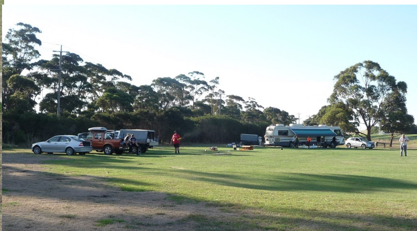
Clear blue skies and a well prepared flying field. What more could you ask for?