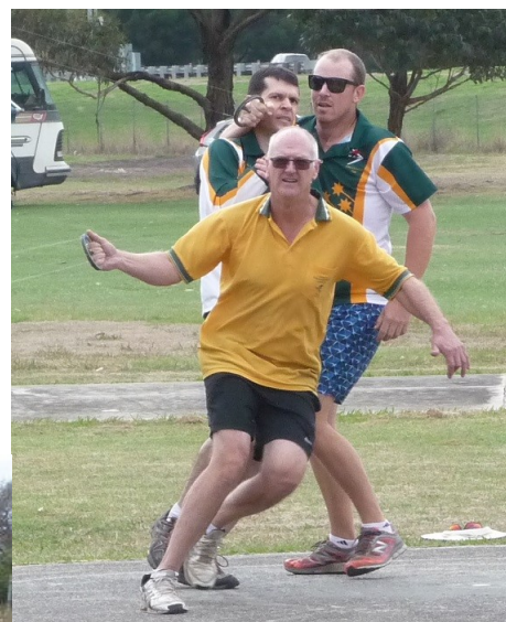
Vic State Champs reports by the Editor.