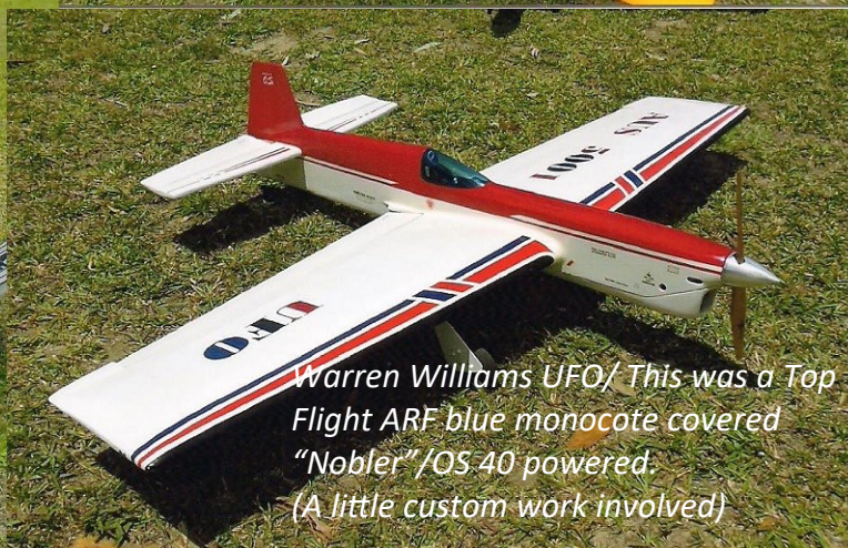
Warren Williams UFO/ This was a Top Flight ARF blue monocoque covered "Nobler"/OS 40 powered. (A little custom work involved)