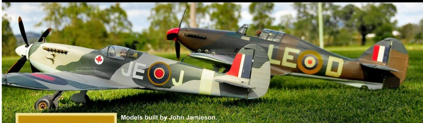
Models built by John Jamieson.

To Receive a 10% discount off all on-line orders please enter the following code at checkout.