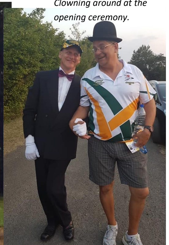
Clowning around at the opening ceremony.