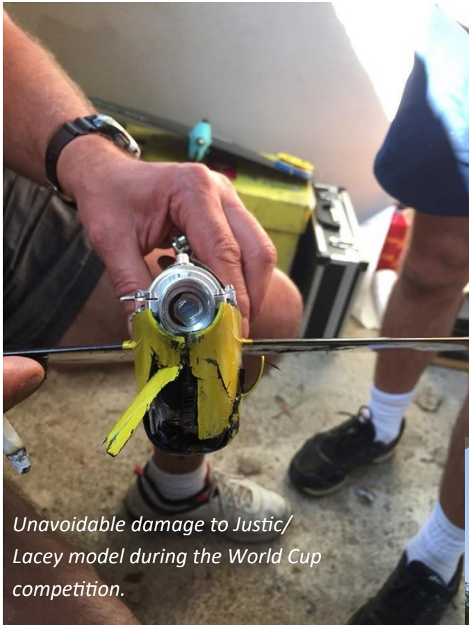
Unavoidable damage to Justic/ Lacey model during the World Cup competition.