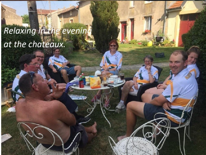
Relaxing in the evening at the chateaux.