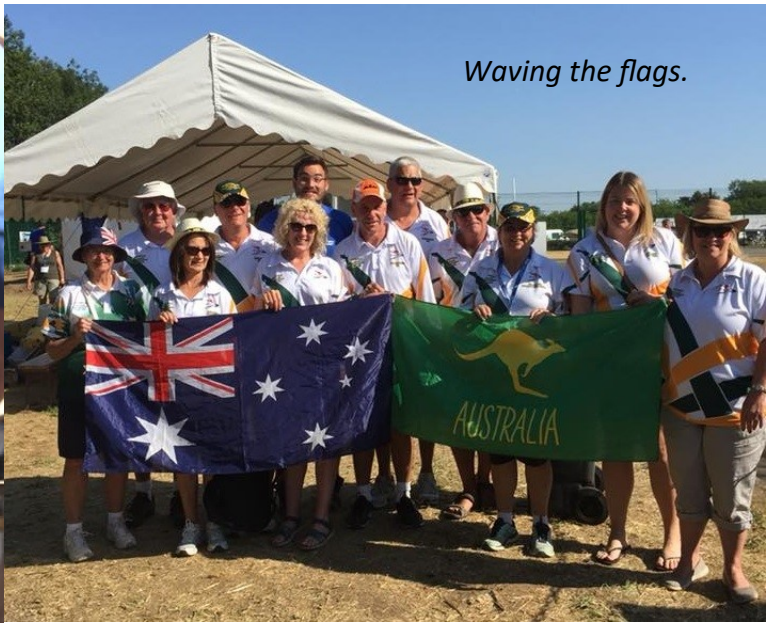
Waving the flags.