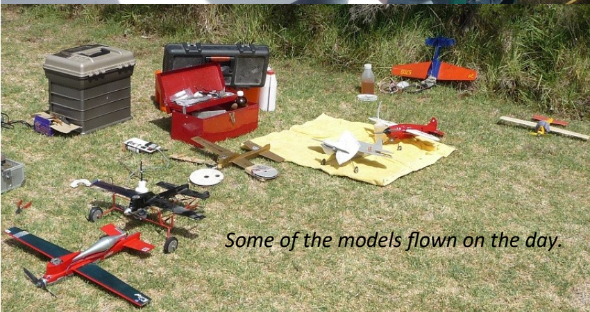
Some of the models flown on the day.