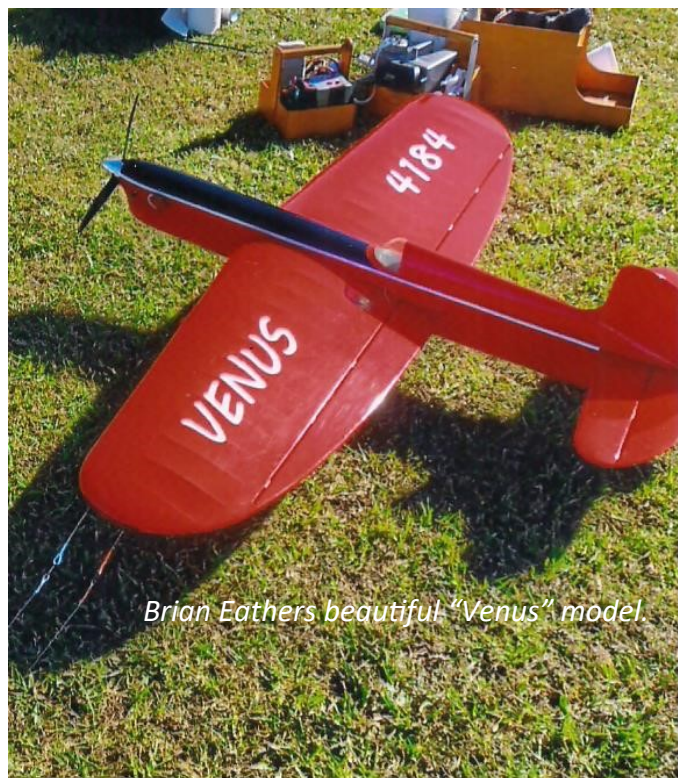
Brian Eathers beautiful "Venus" model