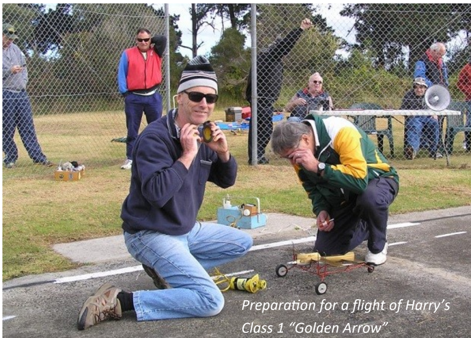
Preparation for a flight of Harry's Class 1 "Golden Arrow"