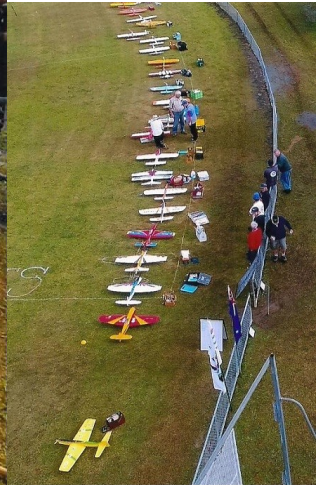
Aerial view of F2B pits.