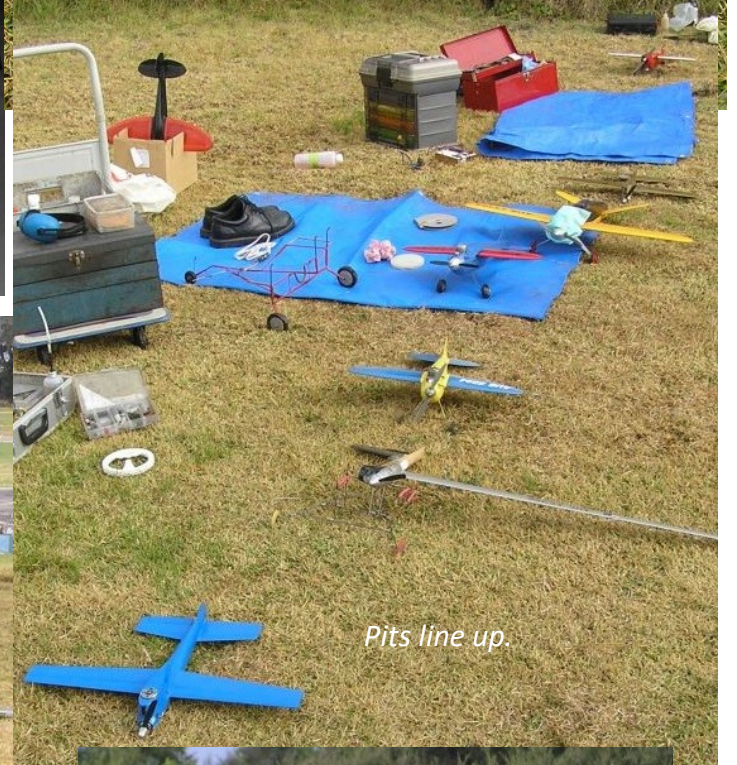
Pits line up.