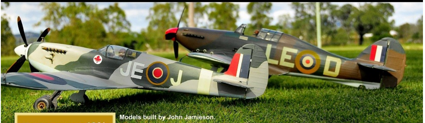
Models built by John Jamieson.

To Receive a 10% discount off all on-line orders please enter the following code at checkout.