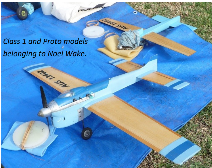
Class 1 and Proto models belonging to Noel Wake.