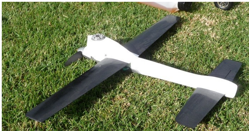
Above:- Murray's Class 2 model was flown using 10% nitro fuel.