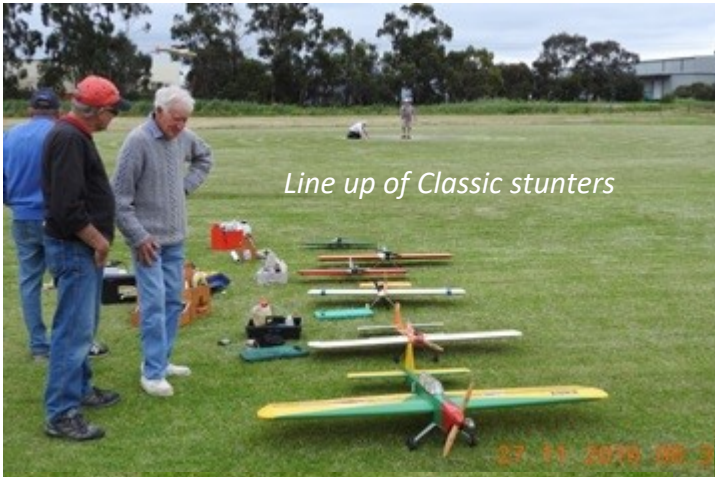
Line up of Classic stunters

Contestants and spectators in the pit area.