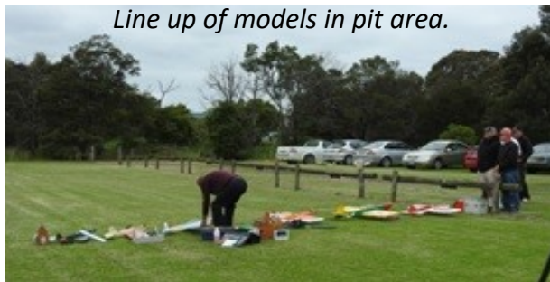
Line up of models in pit area.