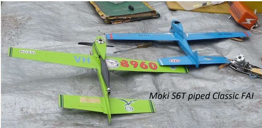
Moki S6T piped Classic FAI