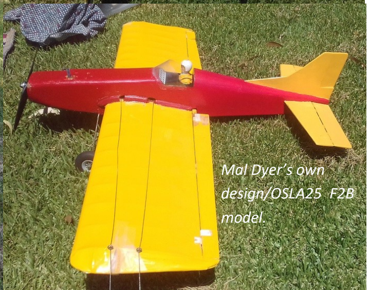
Mal Dyer's own design/OSLA25 F2B model.