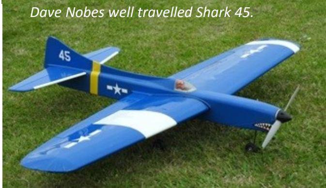
Dave Nobes well travelled Shark 45.