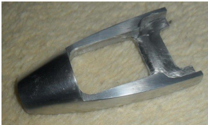
Nelson style pan.