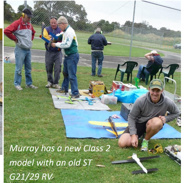
Murray has a new Class 2 model with an old ST G21/29 RV