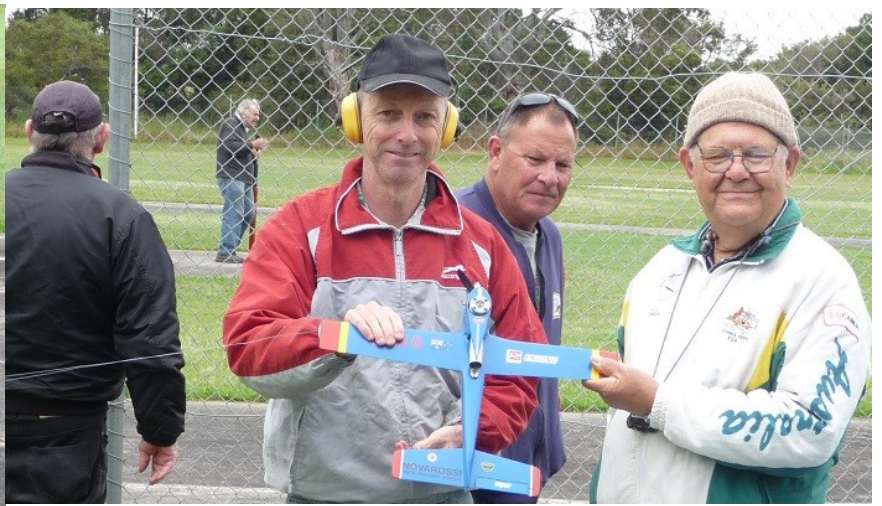
Class 5 Novarossi