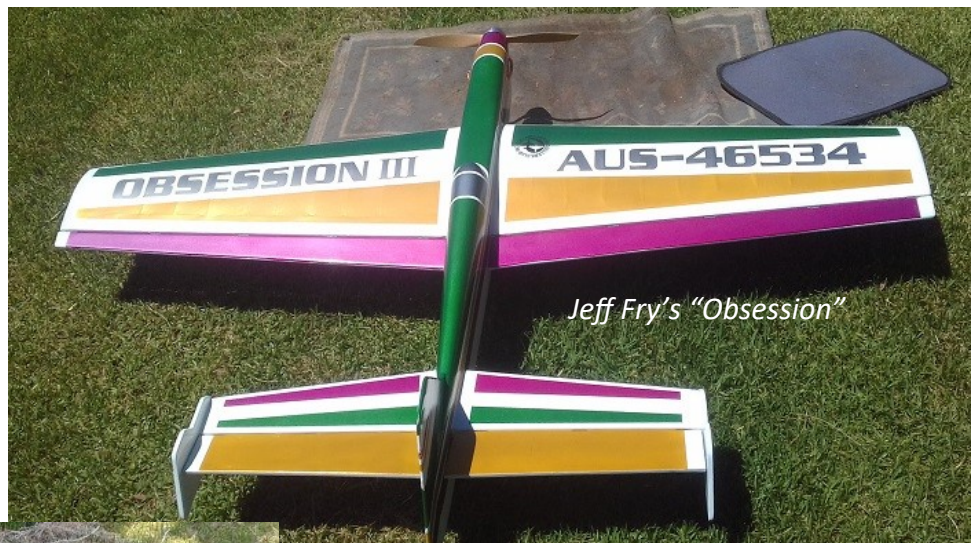
Jeff Fry's "Obsession"

Jeff Prosser had suffered the loss of his electric trivial pursuit the previous week due to sudden power loss during the vertical climb in the clover. The damage to the power train and model was significant so fault finding afterwards proved difficult. His bad luck continued during the comp, the normally rock steady LA 46 in his Formula S developed a back plate leak that prevented him competing despite normal operation in two practice flights earlier in the day.