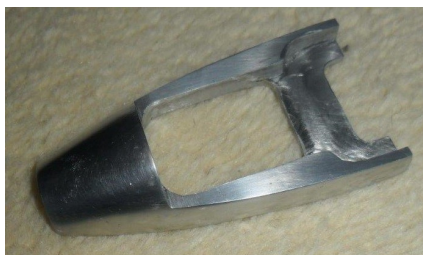
Nelson style pan.