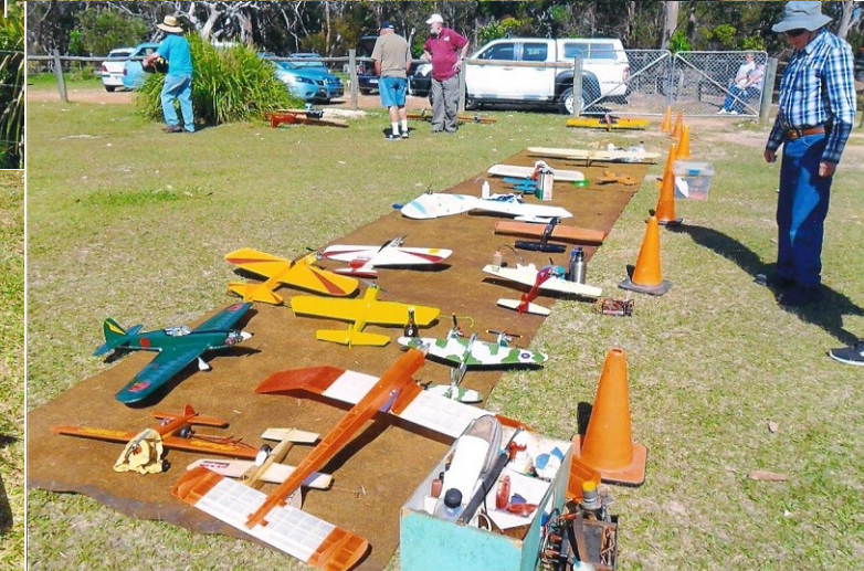
Some pictures from the "Burford Day"