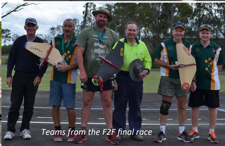
Teams from the F2F final race.