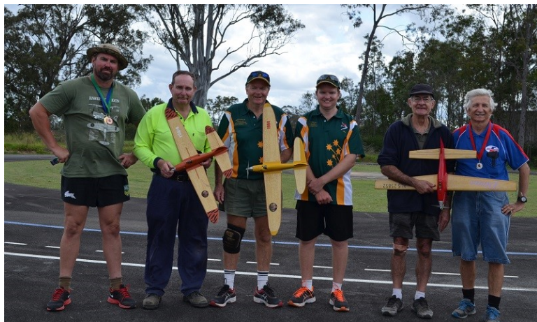
Classic FAI final teams.