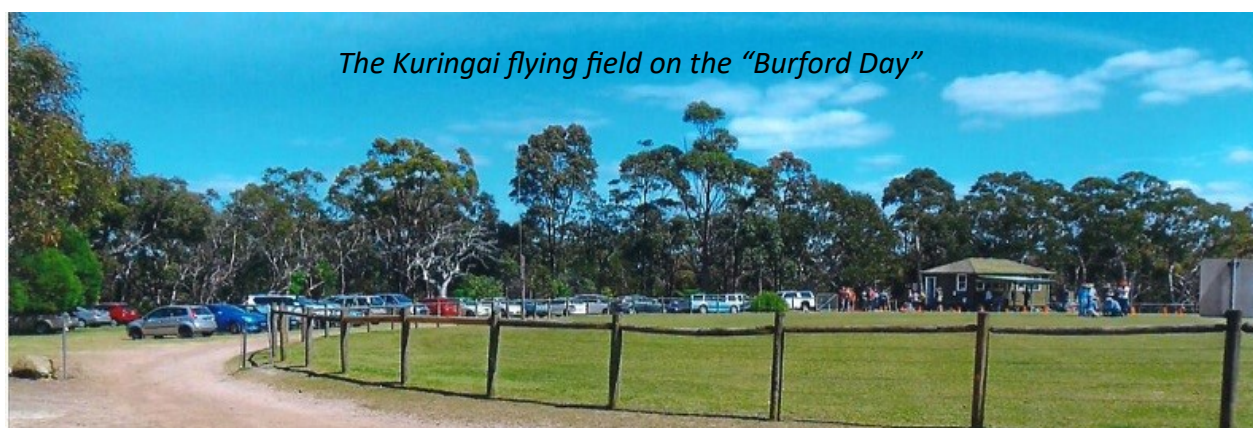
The Kuringai flying field on the "Burford Day"