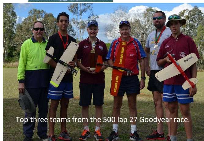
Top three teams from the 500 lap 27 Goodyear race.

The final was a hotly contested race, with only 43 seconds between first and second, over 500 laps.