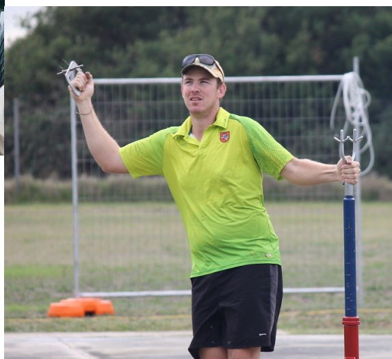
"2016 Champion of Champions"