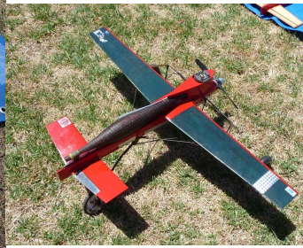
The Class 2 model that was flown by Murray.