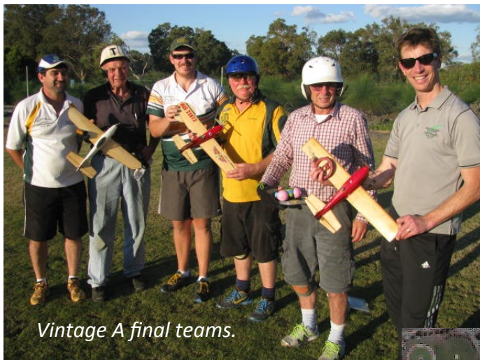
Vintage A final teams.