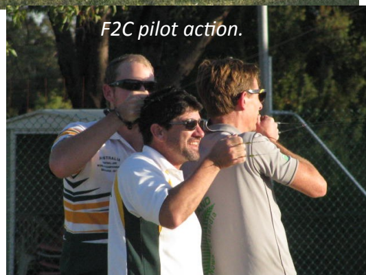
F2C pilot action.