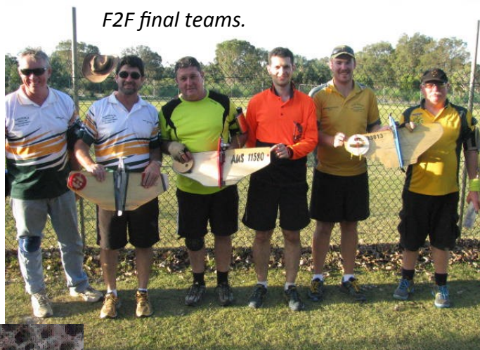
F2F final teams.