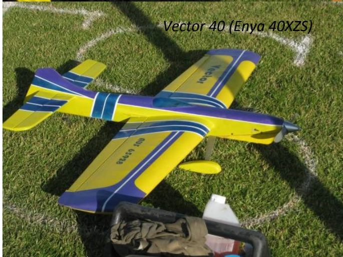
Vector 40 (Enya 40XZS)