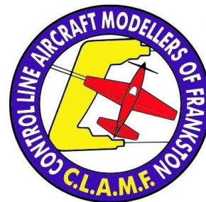
Classic FAI Team Race preparation