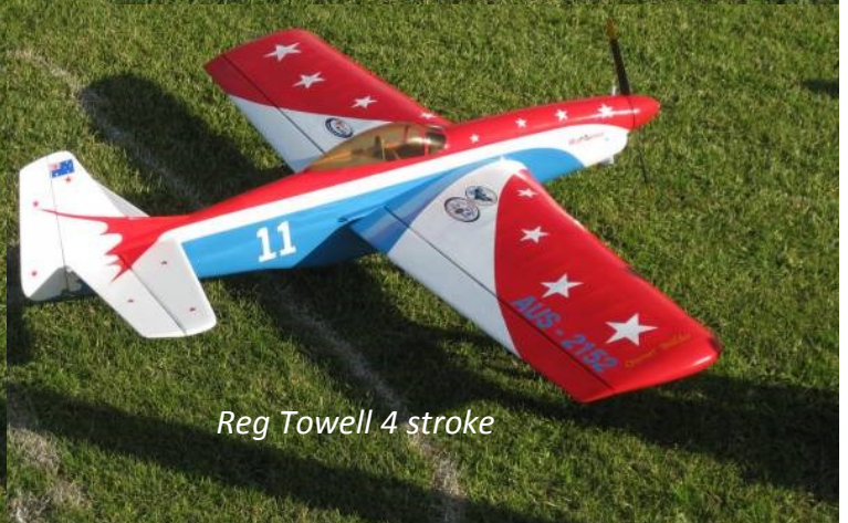
Reg Towell 4 stroke