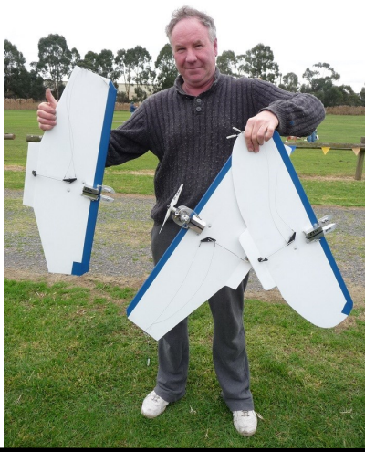
Activities at KMAC.