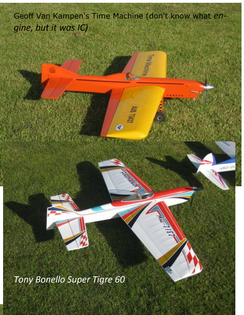
Tony Bonello Super Tigre 60