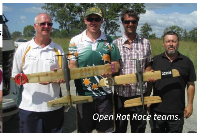
Open Rat Race teams.