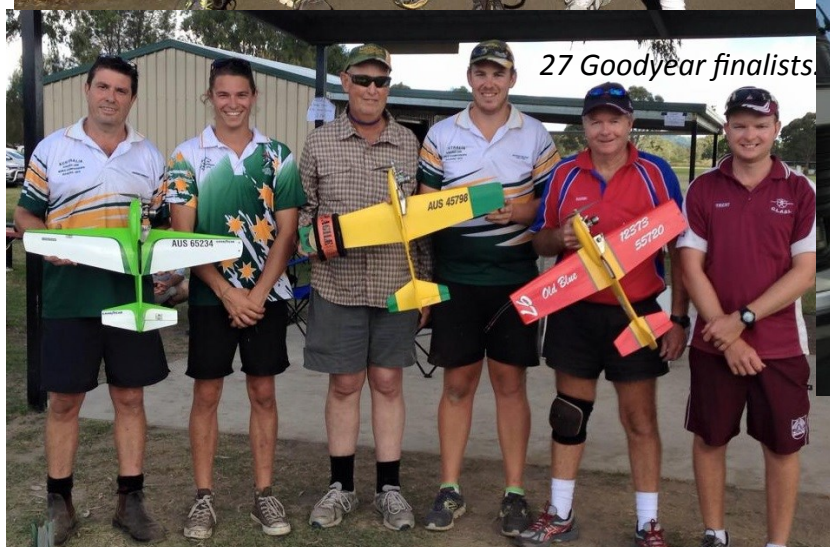
27 Goodyear finalists.