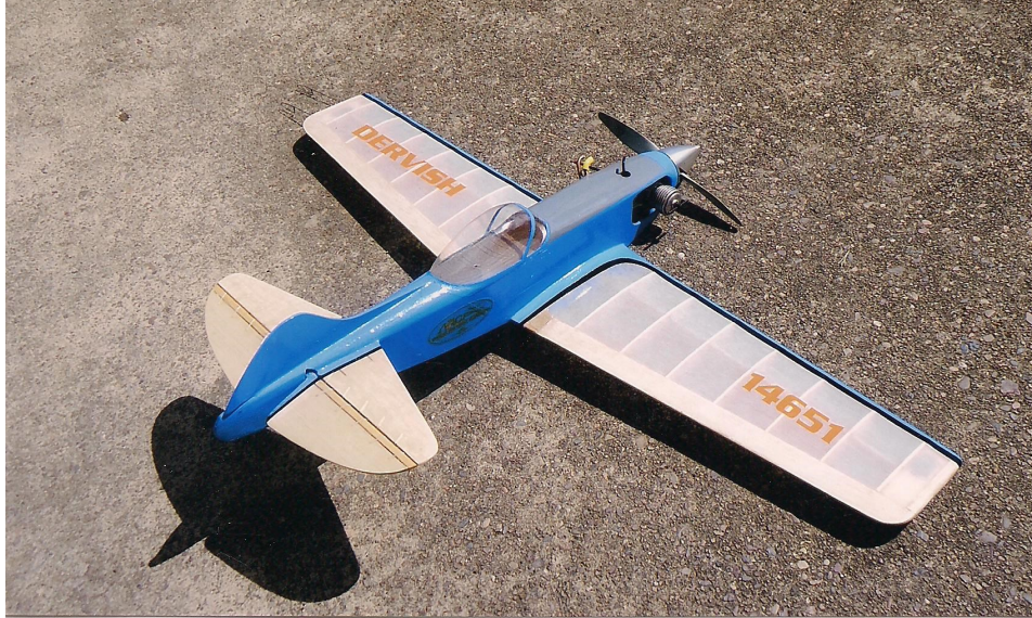
Left:- Cyril Shaw "Dervish", circa 1949. Taifun Hurricane 1.5cc Series 1.