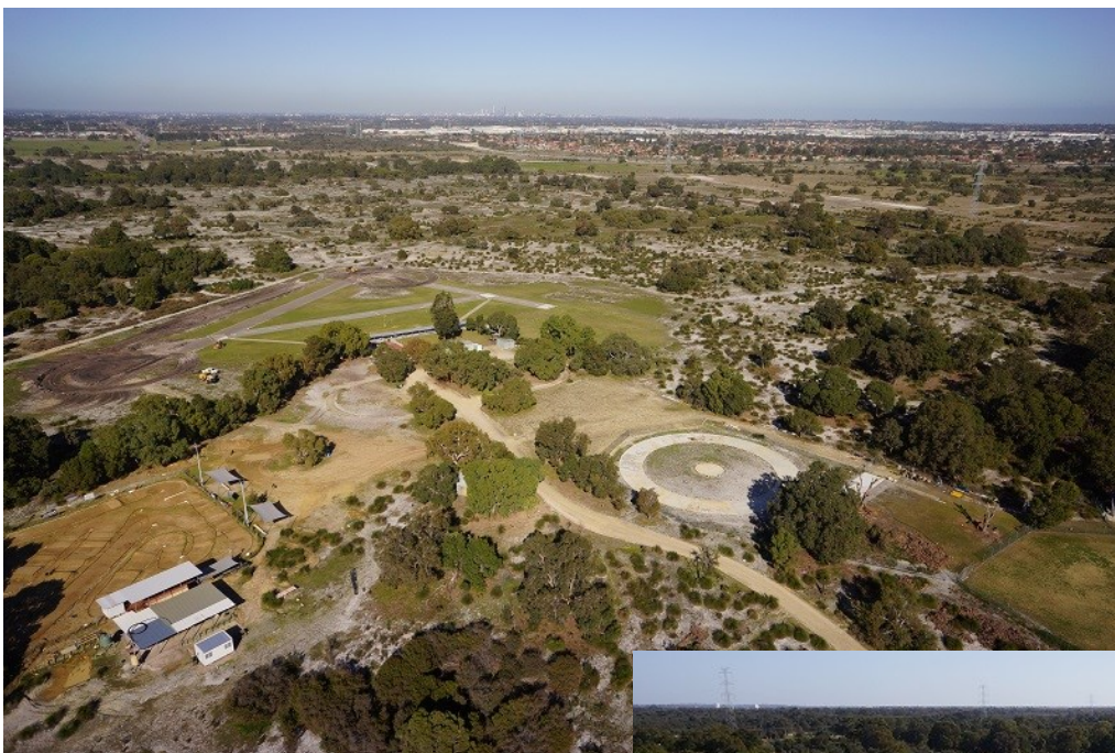
WAMASC Circles - Whiteman Park.

May good fortune go with the team whilst overseas and I am sure that we are all looking forward to 2016 when Australia will host it's first ever F2 World Championships in Perth. The site at Whiteman Park is already well advanced in it's preparation.