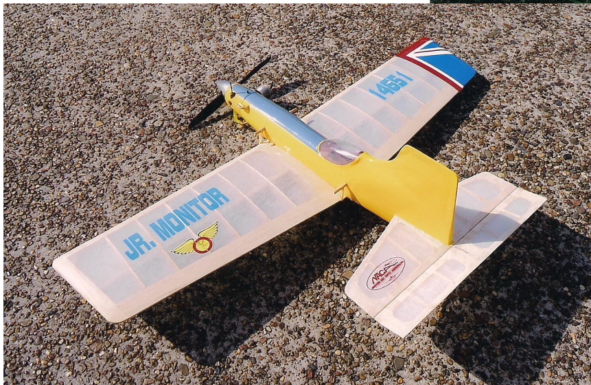
Left:- Mercury "Junior Monitor", 1950. Elfin 2.49cc radial mount, original.