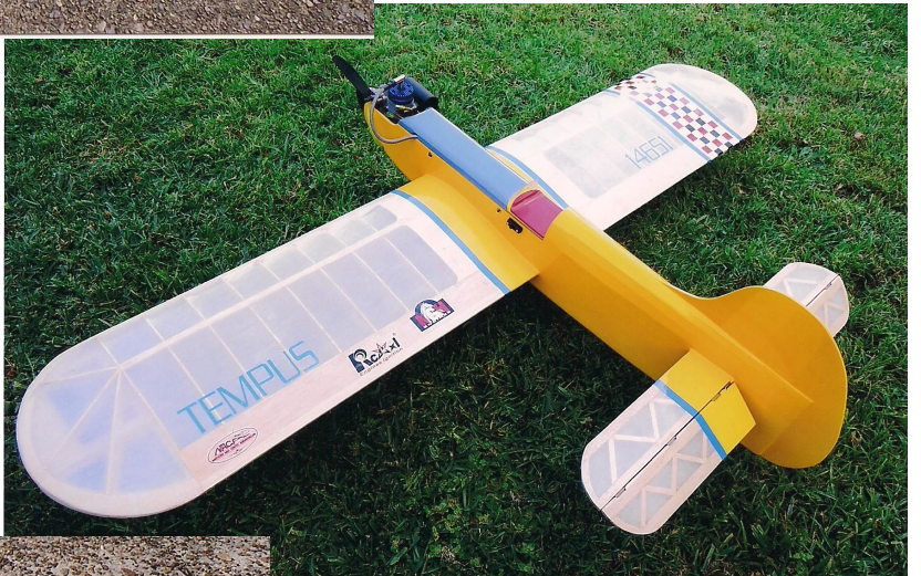
Above:- Own Design 1950—style stunter with NGH 9cc spark ignition engine.