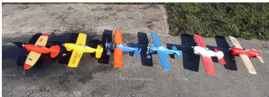
Elliptical, Olympian, two Tarantulas, Tomahawk, Dimpled Dumpling.