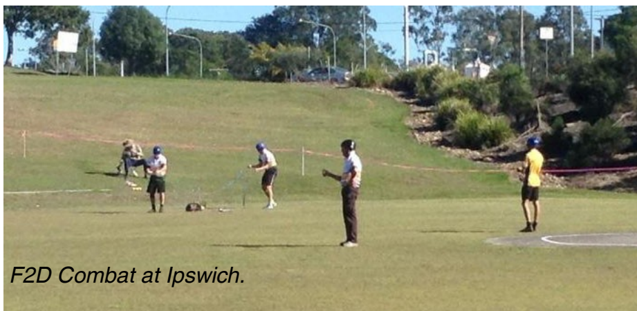
F2D Combat at Ipswich.