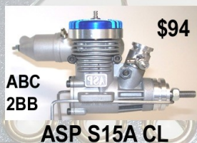
ASP S15A CL $94