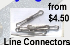
Line Connectors from $4.50