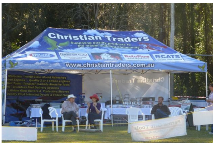
Christian Traders Marquee