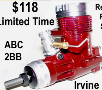
Irvine MkIV .40 CL