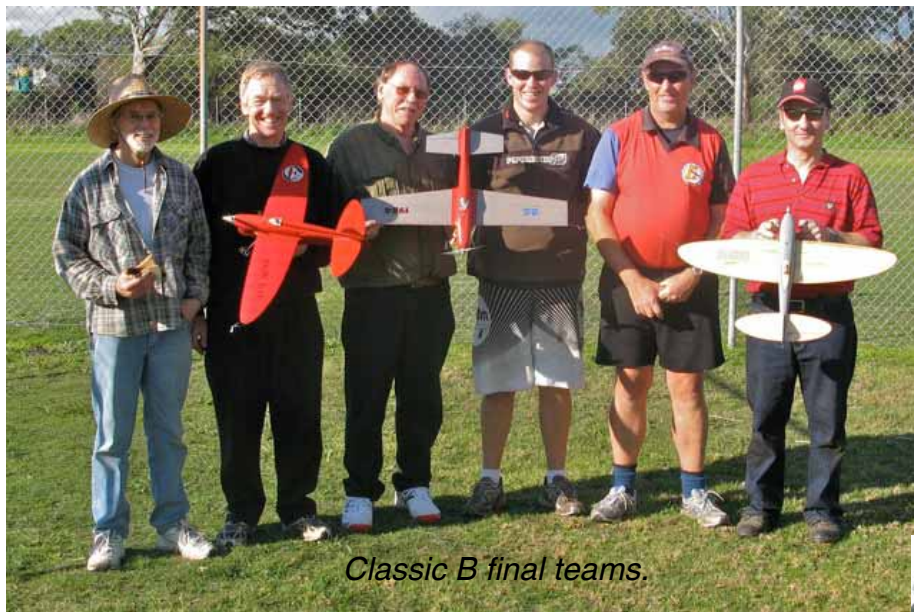
Classic B final teams.