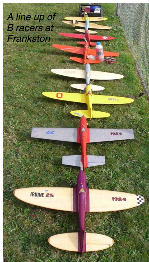
A line up of B racers at Frankston