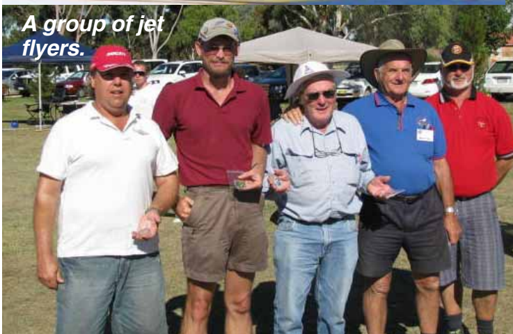
A group of jet flyers.