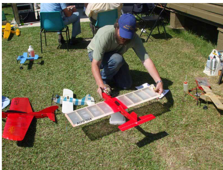
CD Wally Bollinger processing a model for Burford Speed.