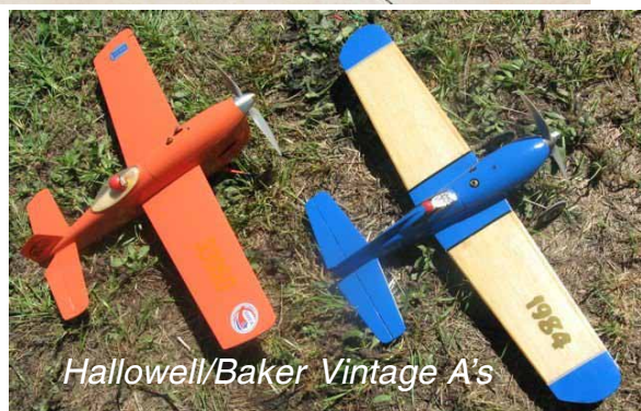
Hallowell/Baker Vintage A's