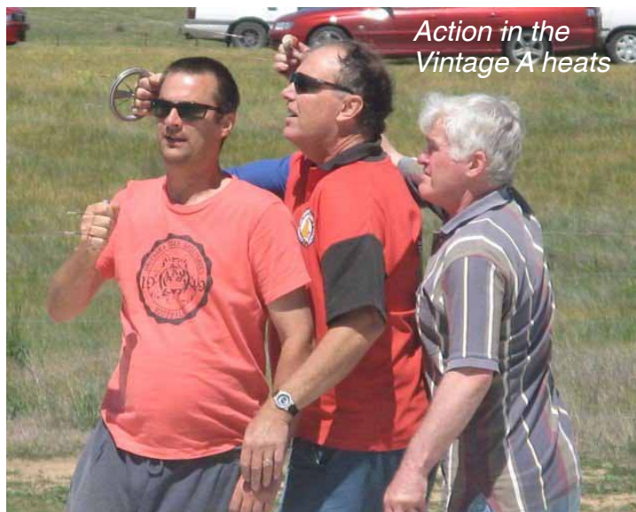
Action in the Vintage A heats