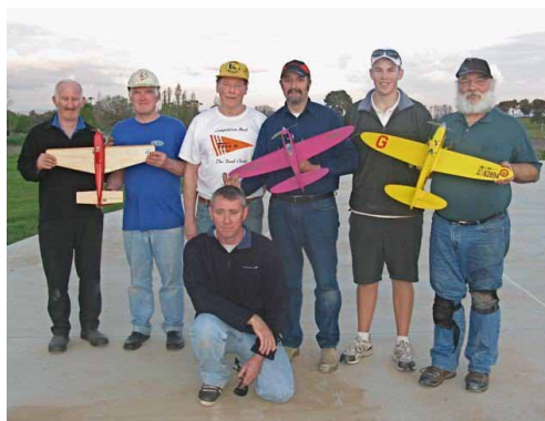
Classic B Finalist