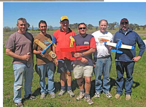
Vintage A Finalist