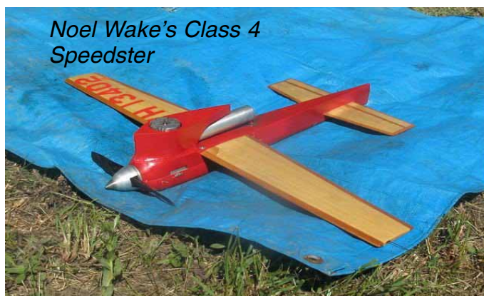
Noel Wake's Class 4 Speedster